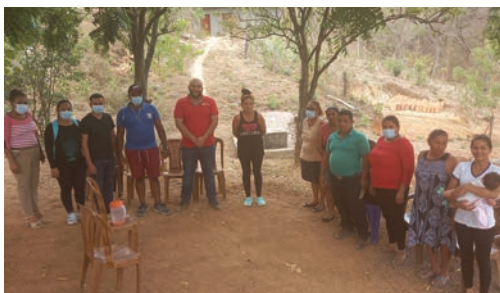
Organized Community of Paso Hondo Santo Tomás del Norte (Paso Hondo)