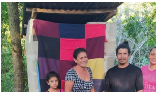
Organized Community of Jiñocua Somotillo (Jiñocua)