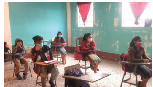
El Triunfo Sololá

Income-generation alternatives for women using recycled materials collected from the municipal landfill