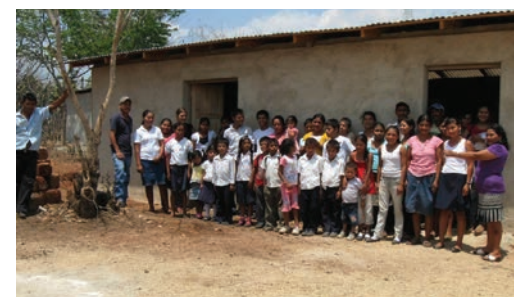
Indigenous People of Mozonte Mozonte

GRCSA project (Gender Responsive Climate-Smart Agriculture with Global Affairs Canada)