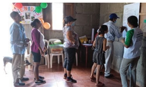
Gaspar García Laviana Collective Santa Teresa

GRCSA project (Gender Responsive Climate-Smart Agriculture with Global Affairs Canada)