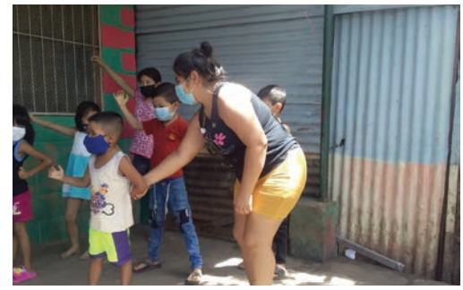
Huellas de Paz Managua

Building a multi-purpose auditorium and Alternative medicine projects