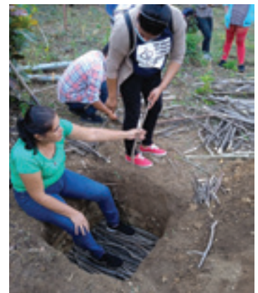
Elaboration of pyrolenous acid Community La Calera